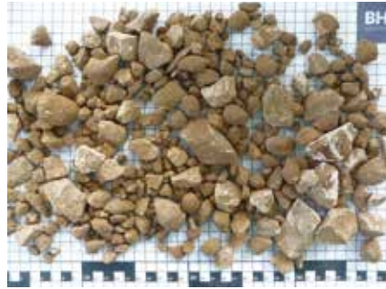
After the Combimix mixing process, screened material > 5 mm is transformed into a clean, salable end product with no clay adhesions.