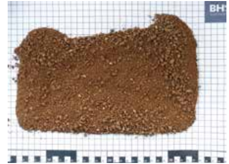
After the Combimix mixing process, screened material < 5 mm containing clay with lime is transformed into salable end product.